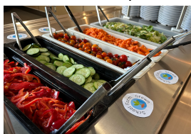
Veggies at the High School Salad Bar