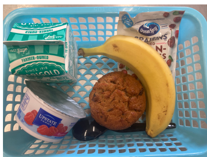
Breakfast Basket at Coupeville Elementary

Let us know what menu items you'd like to see for breakfast!